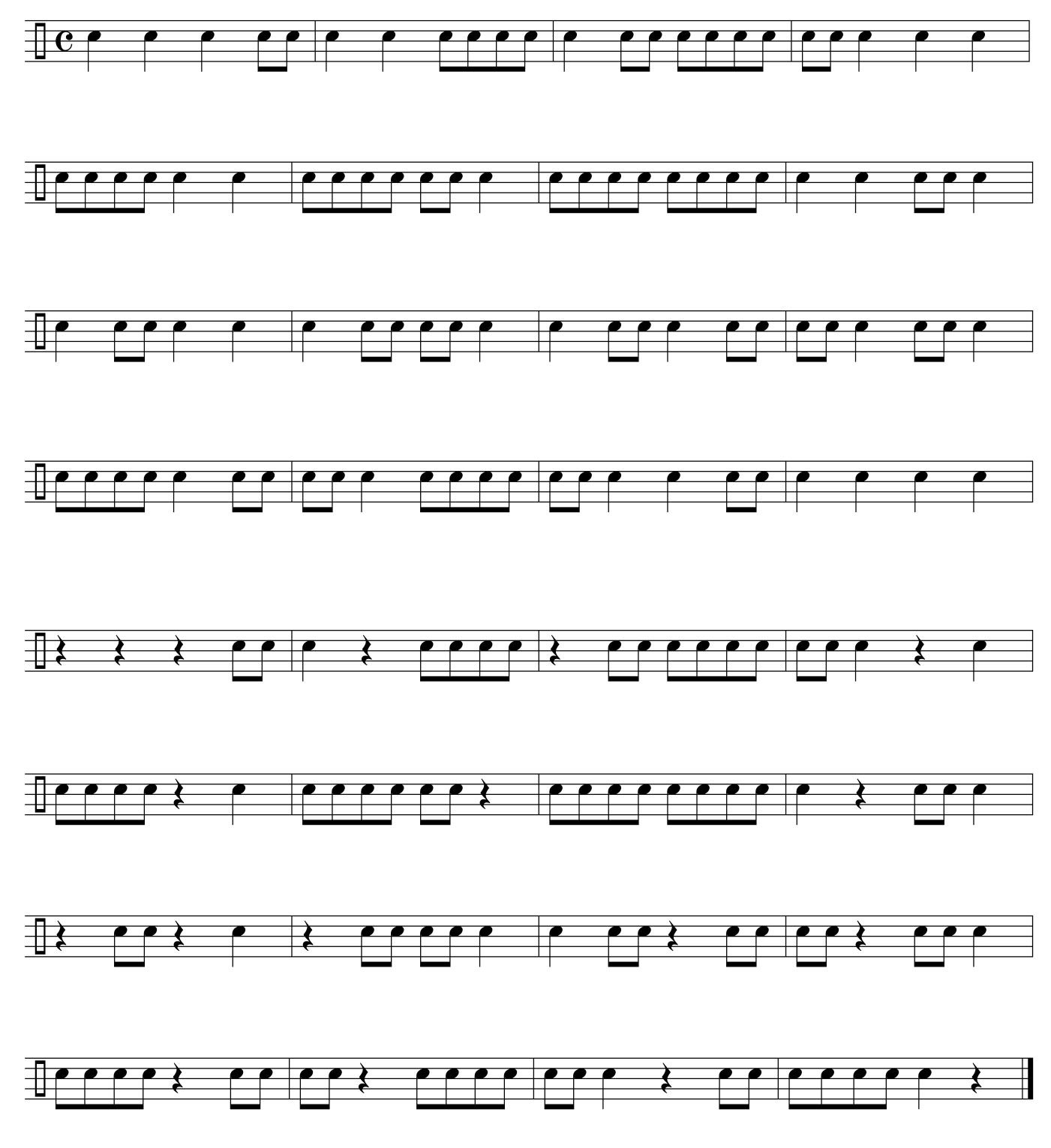
Copyright ©2004 by JazzPath Publishing, Cambridge, MA 02238 International Copyright Secured Printed in U.S.A All Rights Reserved

Make sure you're comfortable saying all of these rhythms before you try playing them. Write in the articulations that you're going to use. Once you can say these rhythms with the correct articulations, play this exercise and change notes at any time.